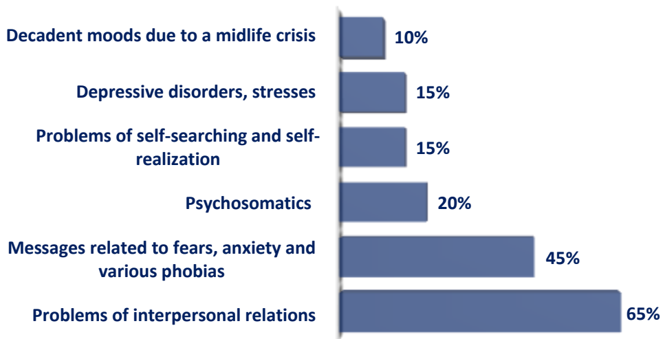
Figure 3. Problems that clients turn to psychologists

Further descending represent: psychosomatics -20%, problems of self-searching and self-realization - 15%, depressive disorders, stresses - 15%, decadent moods due to a midlife crisis - 10%. Psychologists also note an increase in appeals from clients with different sexual orientations who are trying to solve problems of gender identity and establish strong relationships in a homosexual couple (Figure 3).