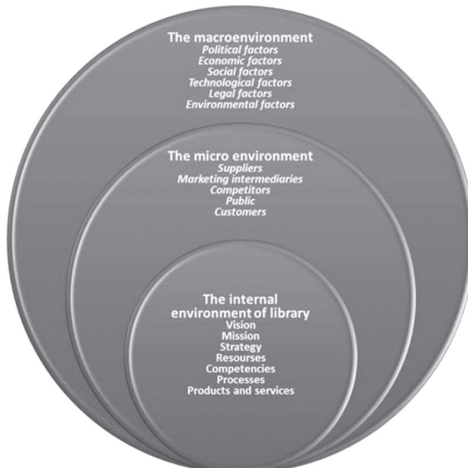
Fig. 1: Library as a system

At the same time, the library is a subsystem of the social and cultural system of the country, and its activity is greatly affected by the different categories of users, organizations, political-legal and scientific environment, contact audiences and others, i.e., the external environment (Fig.1).