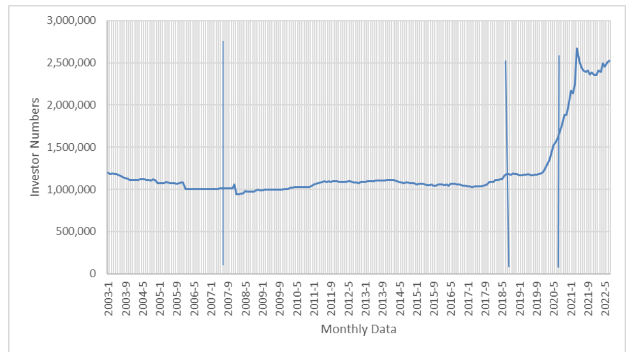
Figure 1: Quarterly Investor Number from 2003 to 2022/7

In Figure 1, fluctuations on investor number by years can be seen more clearly. One can see the important jump of investor number after 2018. This can be caused by the Turkish government's new economic policy. And there can be seen the impact of global financial crisis in 2008.