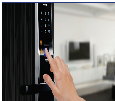
Figure 2. Modern smart padlock

With the introduction of smart devices in the home control system, electronic locks have become the “key element”. They provide extra comfort in use because they can be managed by different methods at the same time (Figure 2). Network-connected padlocks offer both security and flexibility, and their installation is becoming increasingly simple.