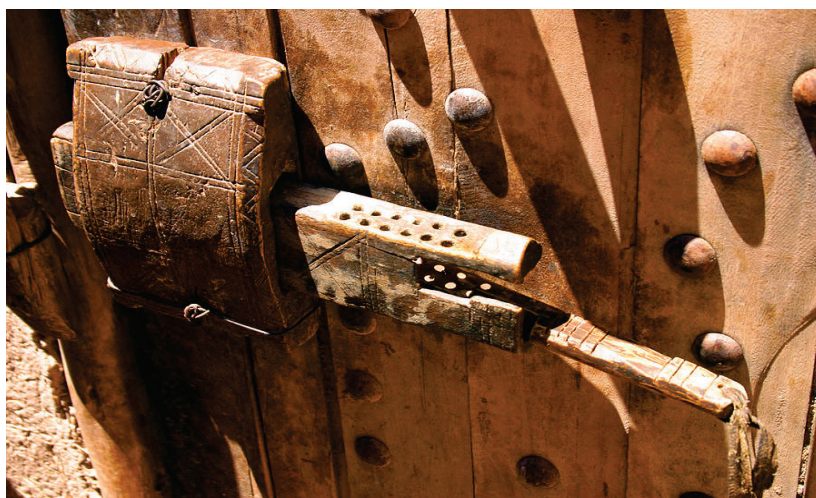
Figure 1. Egyptian padlock

The use of padlocks involves a certain level of responsibility, namely the loss of the key. In order to minimize the risk of losing the key, mechanical digital locks were invented, but even in this case the cipher may be forgotten and the padlock may remain locked.