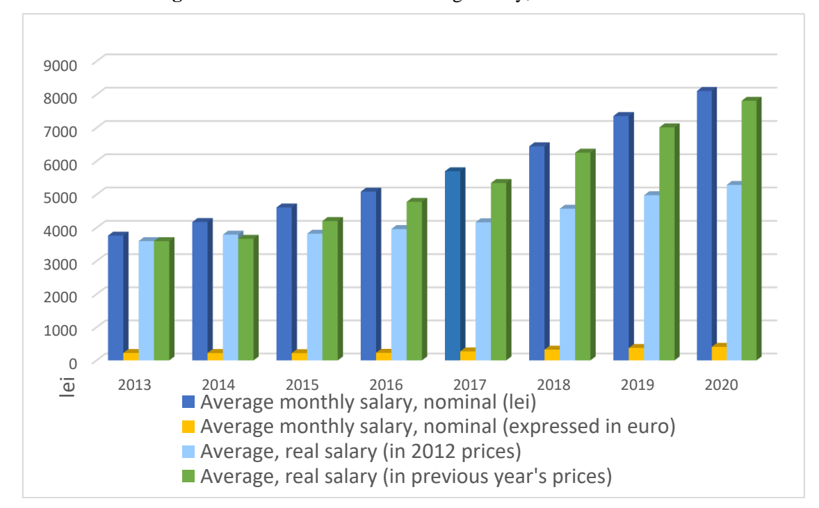
Figure 2. The evolution of the average salary, nominal and real

From the data presented for 2012-2020, it is noted that the average monthly salary in Moldova, constantly, registered an increase, in 2020 it is more than 2 times compared to 2012.