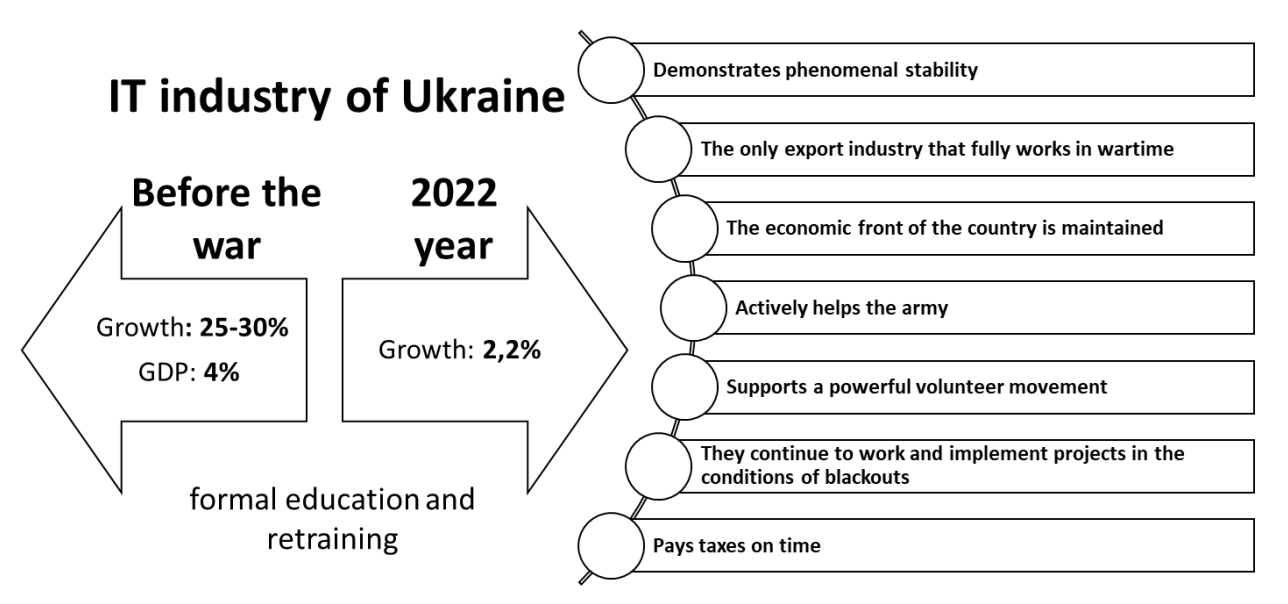
Figure 1. Trends in the Development of Ukraine's IT Industry

use of high-tech tools for conducting military operations. This progress became possible thanks to the assistance provided by European NATO member countries, which supported the rapid transformation of the Ukrainian army according to NATO standards in the shortest possible time. Despite the numerical superiority of Russian forces, Ukrainian troops achieve significant successes on the battlefield due to better technical equipment, specialized software, and high professionalism.