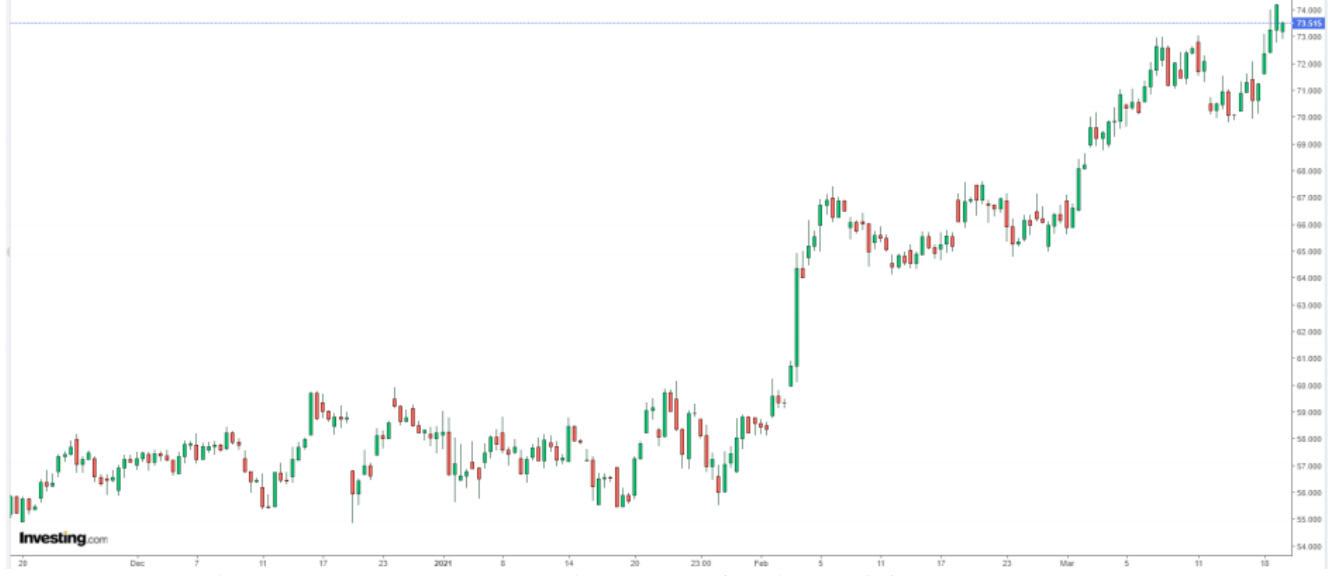
Figure 2: Japanese candlestick chart of Daimler AG over the past 5 months

Next, let's look at the Japanese candlestick chart (figure 2) for a more detailed analysis of the patterns over the past 5 months. In this chart, we can see the dominance of the bullish engulfing on November 11, December 4, January 20 the bearish engulfing only on January 25. Most of the figures for the 5 analyzed months are stars and doji - more than 15 pieces. We also can see a falling wedge in December, a bearish pennant in early January, and a bullish pennant in early February. There is also an evening star on the chart on December 1 and January 22. And the morning star on October 29 and January 11. At the end of the period, an evening star is traced on the chart, and accordingly the price will most likely fall.