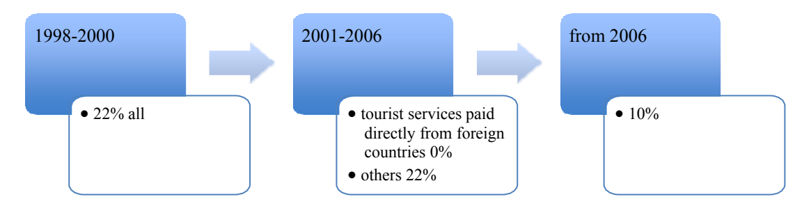
Figure 1. VAT rate on tourist services

Tourist sector experienced few changes during this, almost a decade of VAT in Croatia. At the beginning tourist services was taxed by general rate of 22%, after that it was prescribed that tourist services paid directly from foreign countries are free of VAT (taxed with 0%). At that time there was difference in tax burden for domestic tourist and foreign tourist that paid used tourist services in Croatia in respect to this foreign tourist that paid used tourist services. Result of that is the same tax status of domestic and foreign tourists. Due to that difference in tax burden is eliminated and amount of tax paid is the same for domestic and foreign tourists.